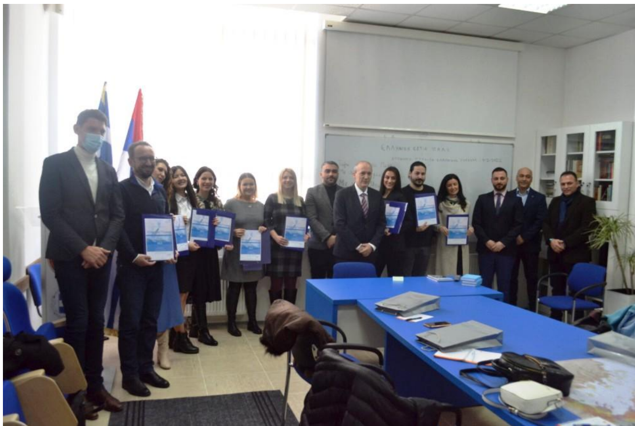
The Greek Corner in Pale, Greek language course diplomas (2022)