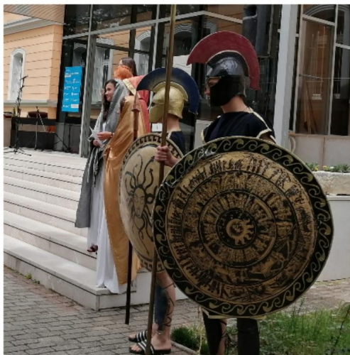
The Greek Corner in Visoko, Official opening (2021)