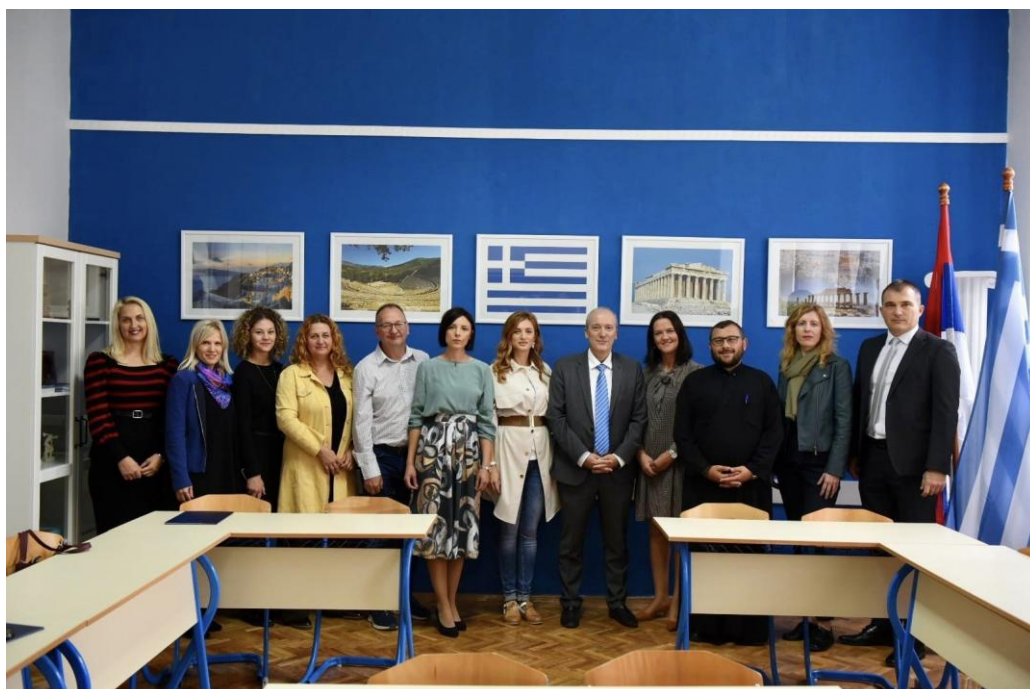
The Greek Corner in Prijedor, Official opening (2022)