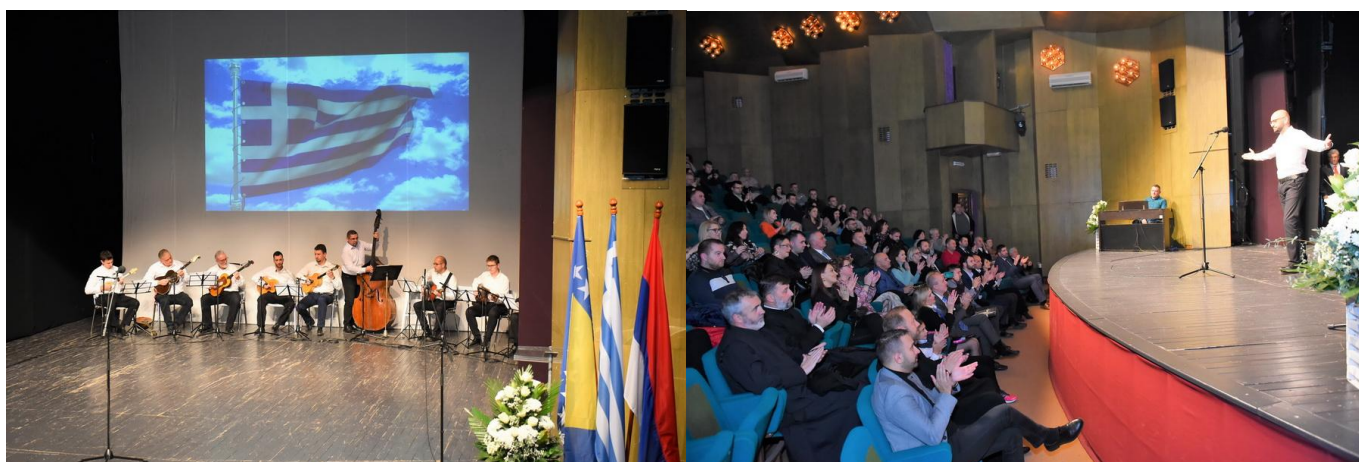
The Greek Night event in Prijedor (2021)