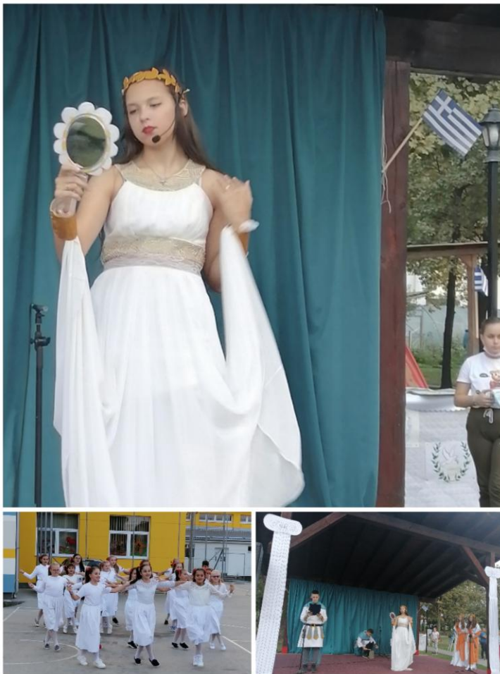
The Greek Day event in Stanari (2021)