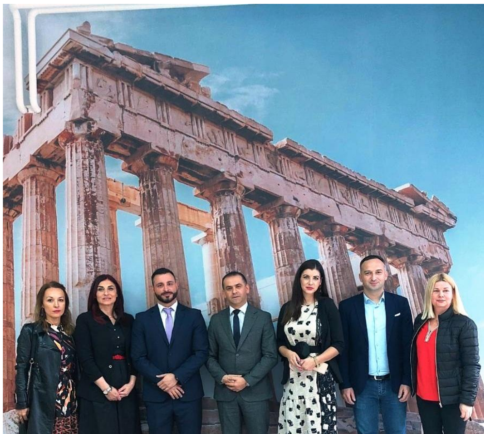
The Greek Corner in Šamac, Official opening (2022)