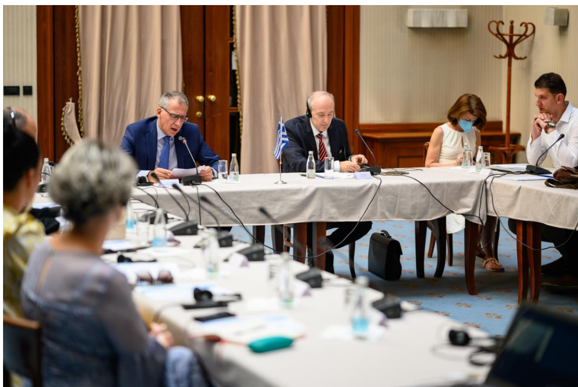
1 st Coordination Meeting of Greek Corners in BiH (Hotel Europe, Sarajevo, July 2022)