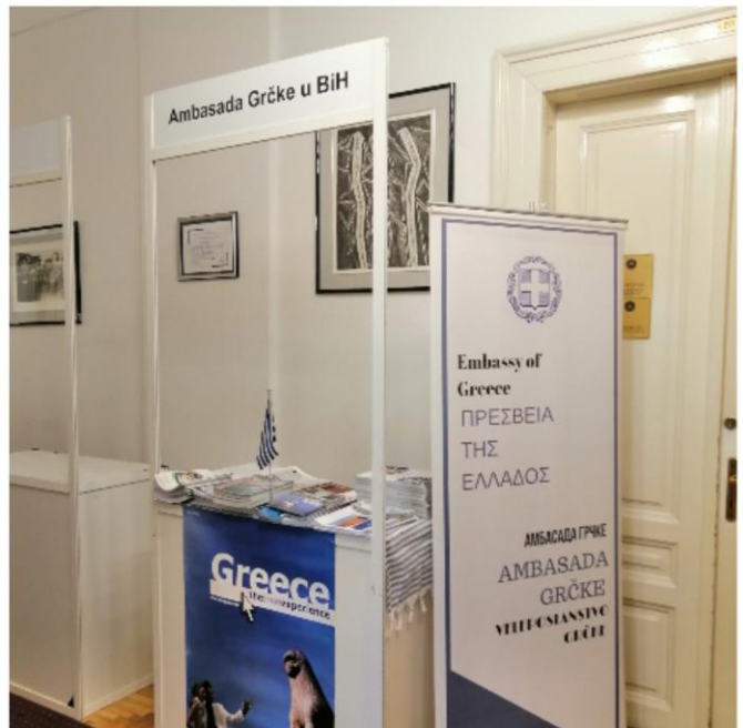
The 12 th Scholarship Fair, University of Sarajevo (26 October 2022)