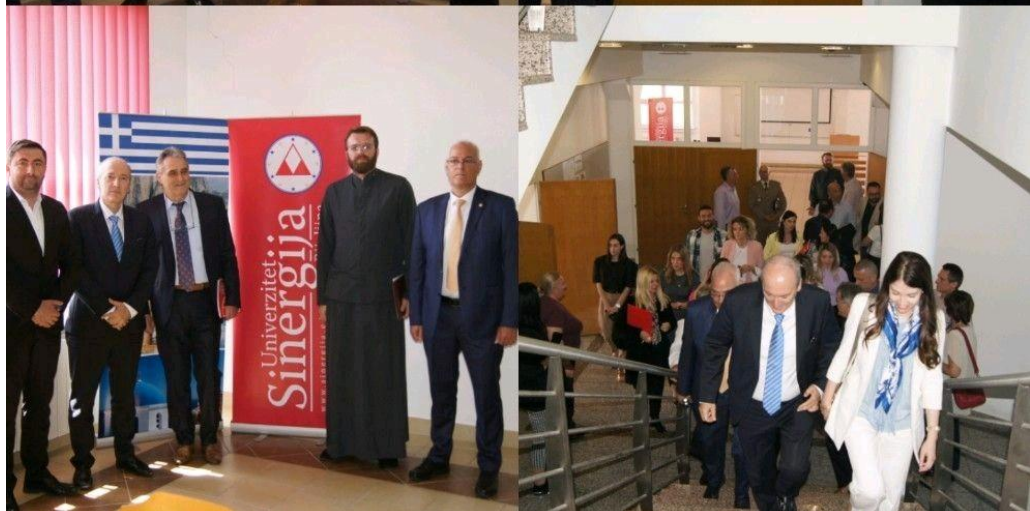
The Greek Corner in Bijeljina, Official opening (2022)