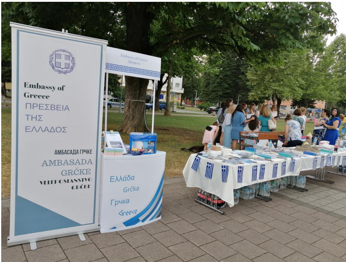
The Greek Day event in Doboj (2021)