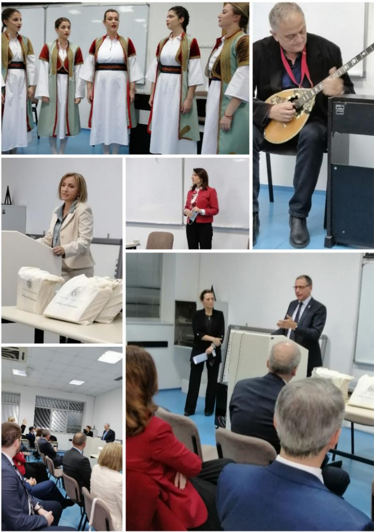
The Greek Corner in Banja Luka, Official opening (2021)