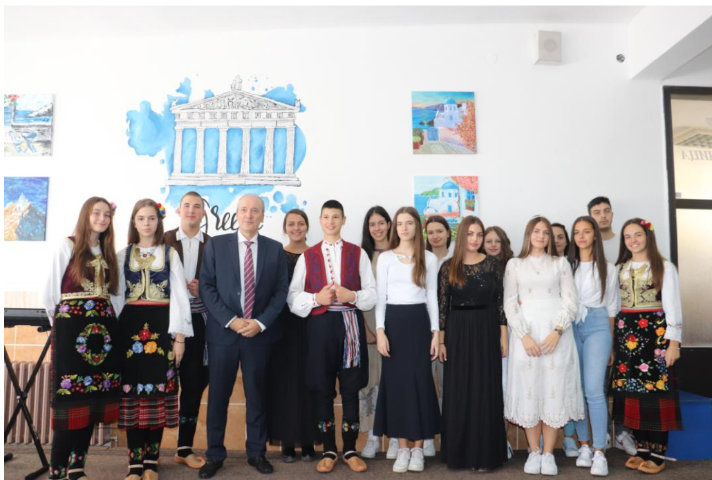
The Greek Corner in Višegrad ,Official opening (2022)