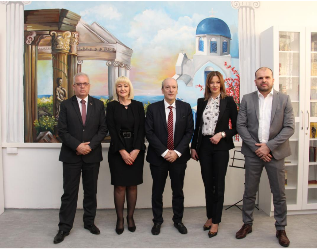
The Greek Corner in Zvornik, Official opening (2022)