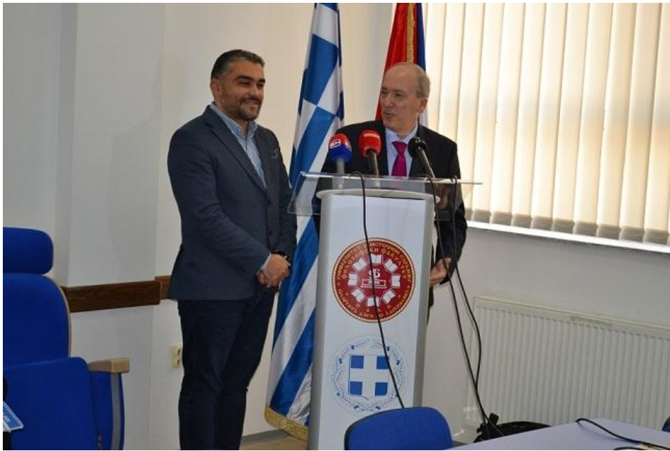
The Greek Corner in Pale, Official opening (2021)