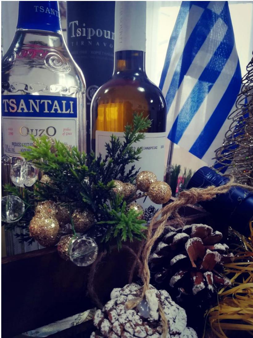
Charity event in Sarajevo - The Winter Diplomatic Bazaar(2019)