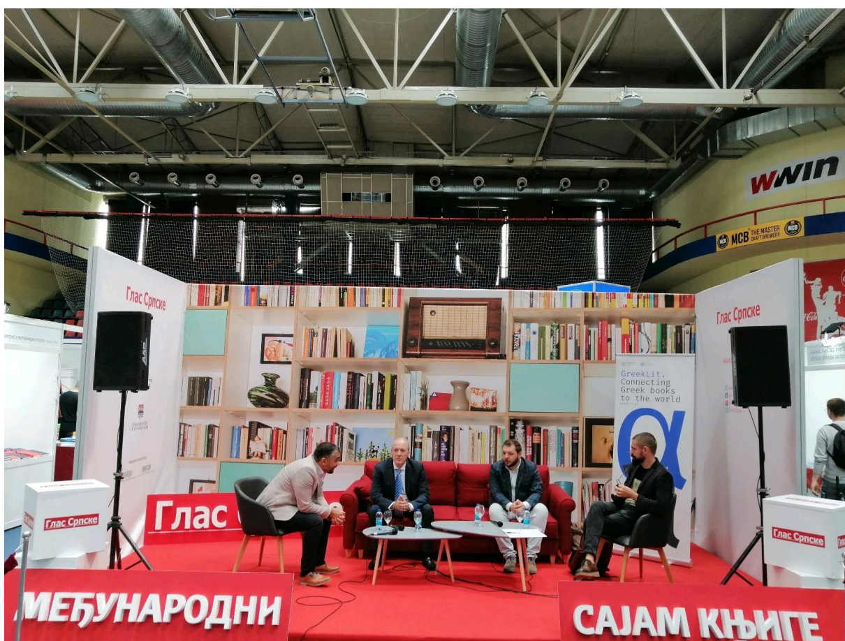
The International Book Fair in Banja Luka, Panel discusion (2022)