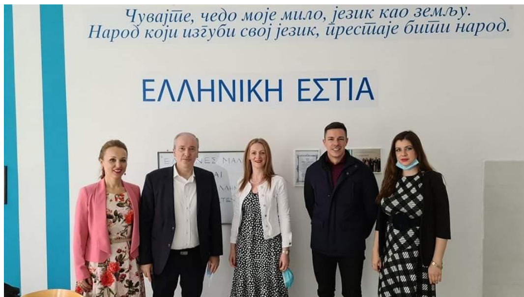
The Greek Corner in Doboj, Official opening (2021)