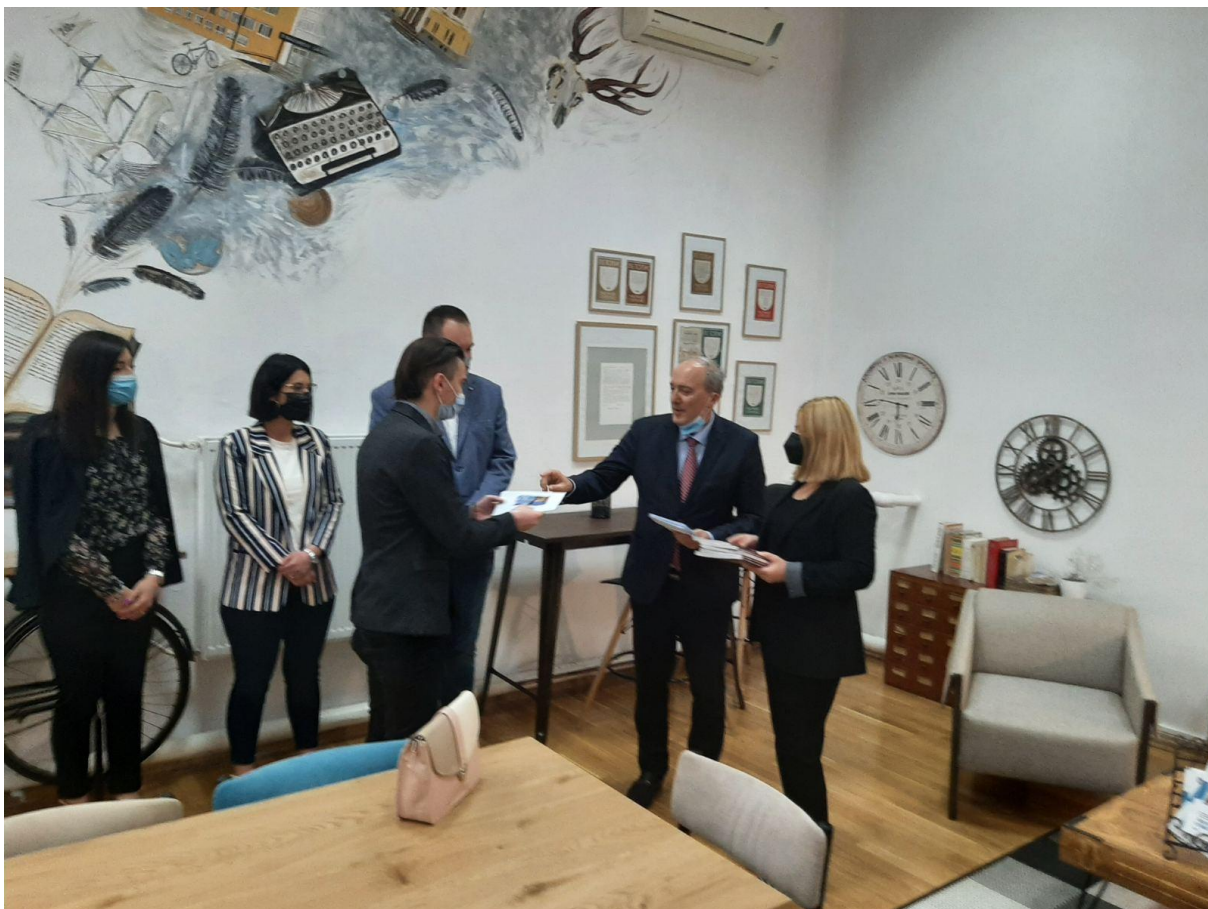
Greek Revolution Essay Awards - Banja Luka 2021