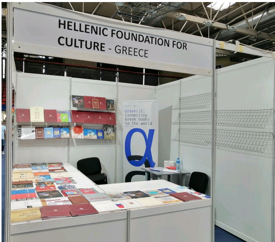
The International Book Fair in Banja Luka (2022)